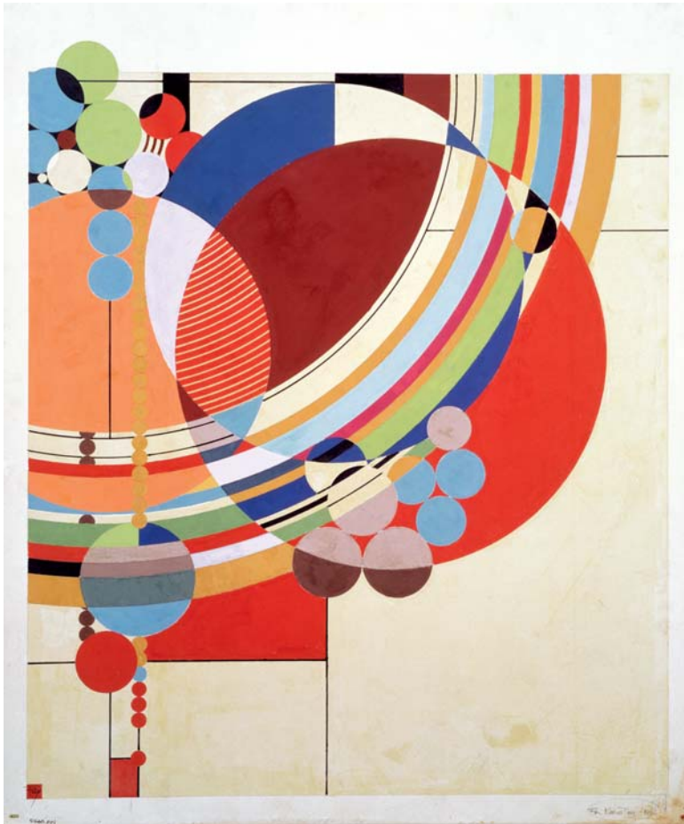
Frank Lloyd Wright, Carpet Design for Taliesin Line project, submitted to Karastan, 1955, tempera on illustration board.