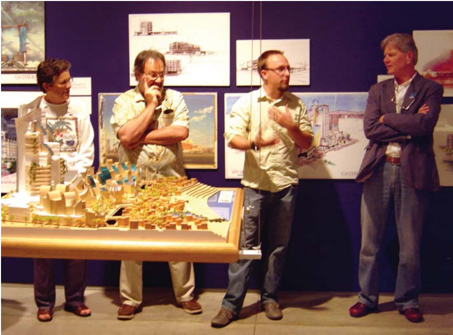
UN-BUILT RENO: ALTERNATIVE ARCHITECTURAL LANDSCAPES