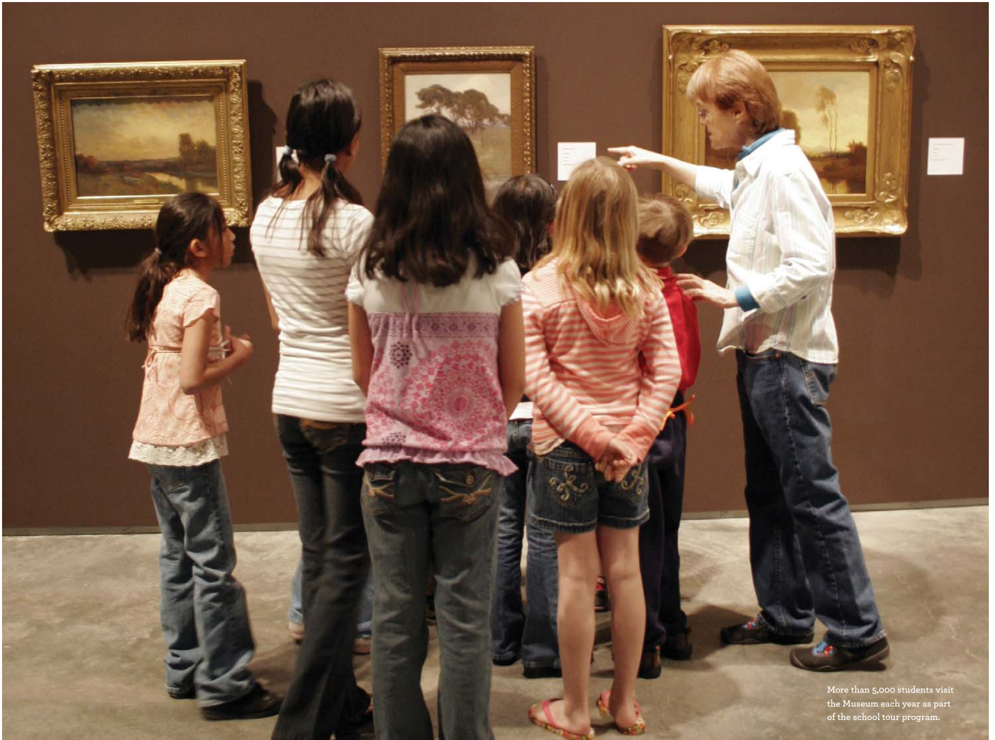
More than 5,000 students visit the Museum each year as part of the school tour program.