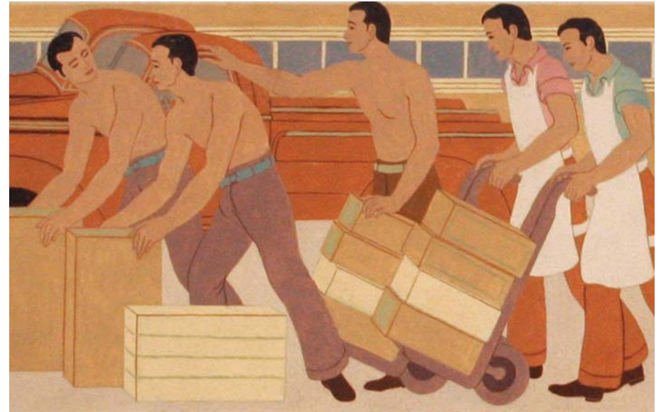
Helen Lundeberg, History of Transportation (detail), 1940. Mixed media on illustration board. Purchased with funds provided by the E. L. Wiegand Foundation.

The sub-categories include: Altered Landscape, Sierra Nevada/Great Basin, Contemporary, Historical, and the E. L. Wiegand Collection. ■