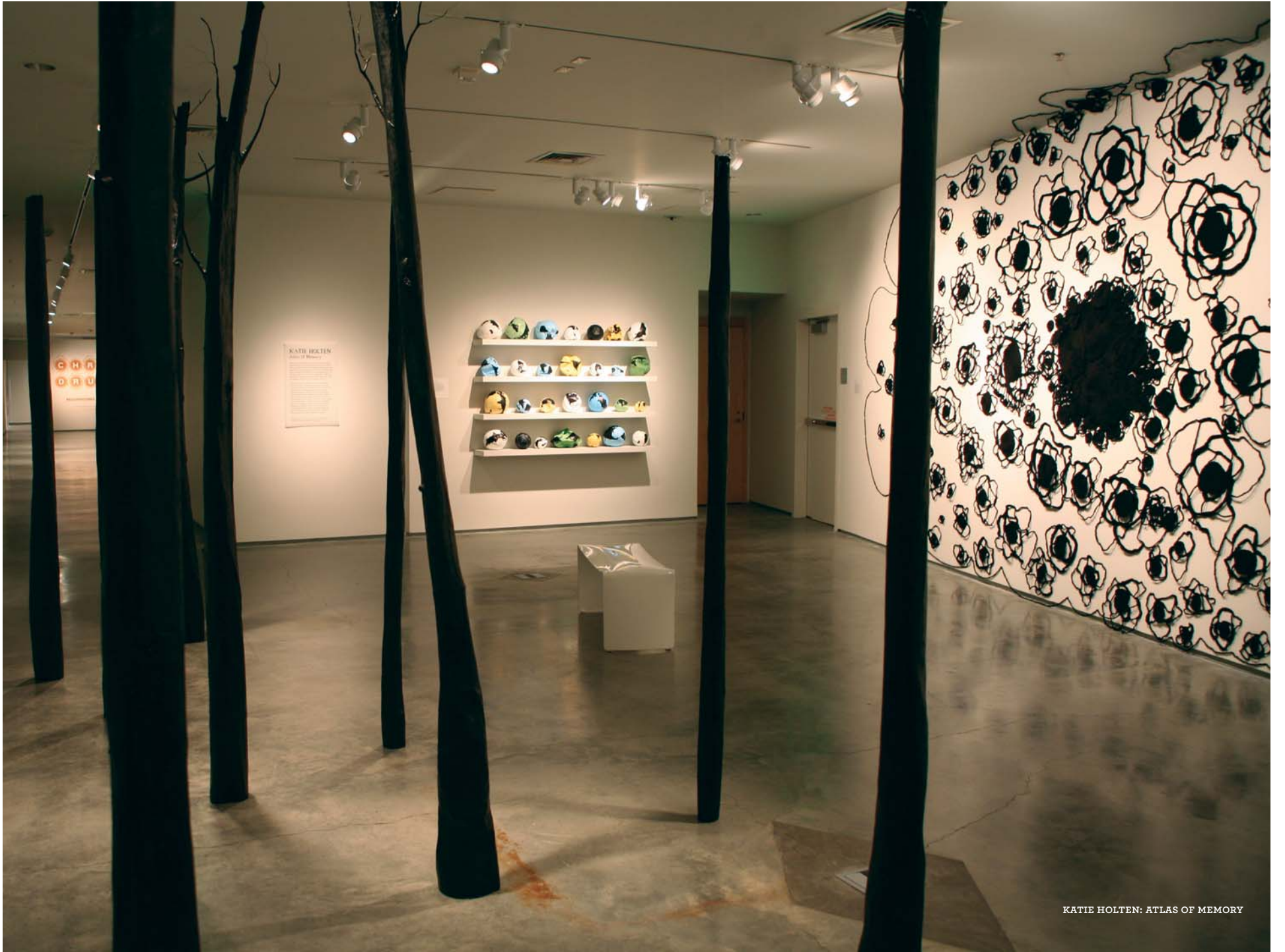
KATIE HOLTEN: ATLAS OF MEMORY