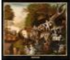
Attributed to Edward Hicks American, 1780–1849 The Peaceable Kingdom with the Leopard of Serenity , 1835–40 Oil on canvas Painted in Newtown, Pennsylvania