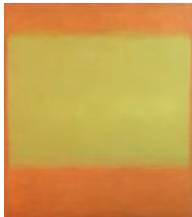
Mark Rothko Untitled (Yellow on Orange) no. 579 1957 Oil on canvas 79-3/8 x 69-1/4 inches Private Collection