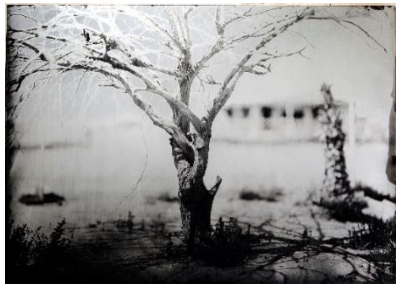
Ian Ruhter Home Ambrotype April 12, 2017 Courtesy of Ian Ruhter / Silver & Light