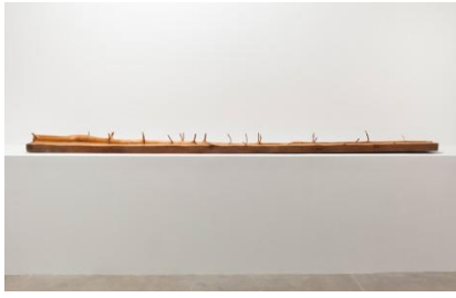
Giuseppe Penone Albero di 3,50 metri 1985 Fir wood 140 1/8 x 11 1/8 x 6 1/4 inches Private Collection