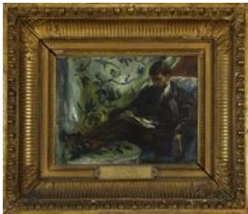
Pierre-Auguste Renoir Portrait d'Edmond Maitre (Le Liseur) 1871 Oil on canvas 8 3/4 x 11 3/8 inches Private Collection