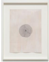
Giuseppe Penone Propagazione 2006 Print ink and permanent ink on scroll 26 5/8 x 19 3/4 inches Framed: 35 x 28 x 2 3/8 inches Private Collection