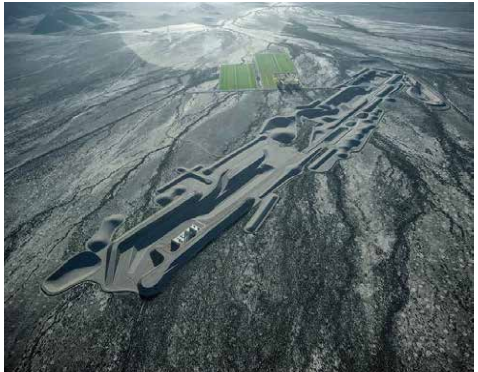
Michael Heizer's "City" Looking East, Garden Valley, Nevada