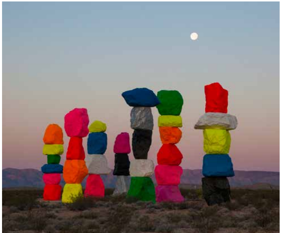
↑ Ugo Rondinone: Seven Magic Mountains, Las Vegas, Nevada, 2016.