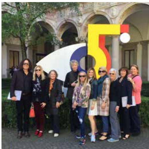
← Donors and staff outside the Salone del Mobile in Milan, Italy