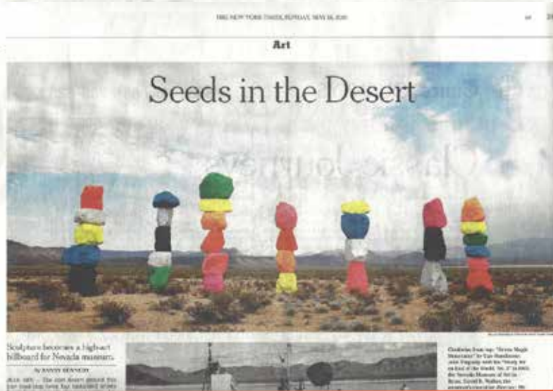
↑ New York Times Artist, Arts & Leisure in print May 15, 2016