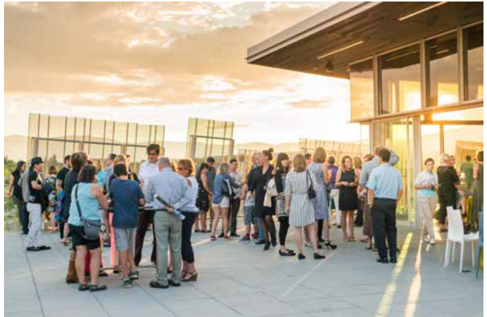
↑ Visitors admiring the Western Sky during First Thursday