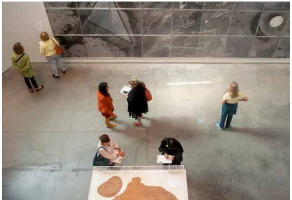
↑ James Turrell, Roden Crater