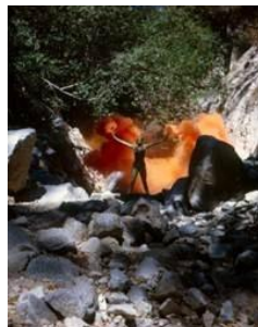
Judy Chicago Smoke Goddess/Woman with Orange Flares, 1972 Inkjet print on Epson paper 19 ¾ x 24 inches