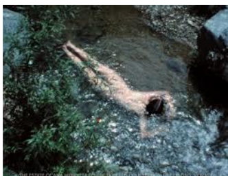
Ana Mendieta (1948-1985) Creek, 1974 Super-8mm film transferred to high-definition digital media Running time 3:11 minutes Courtesy of The Estate of Ana Mendieta Collection, LLC and Galerie Lelong & Co., New York