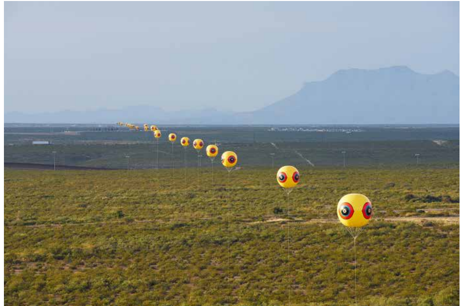
↑ Postcommodity, Repellant Fence