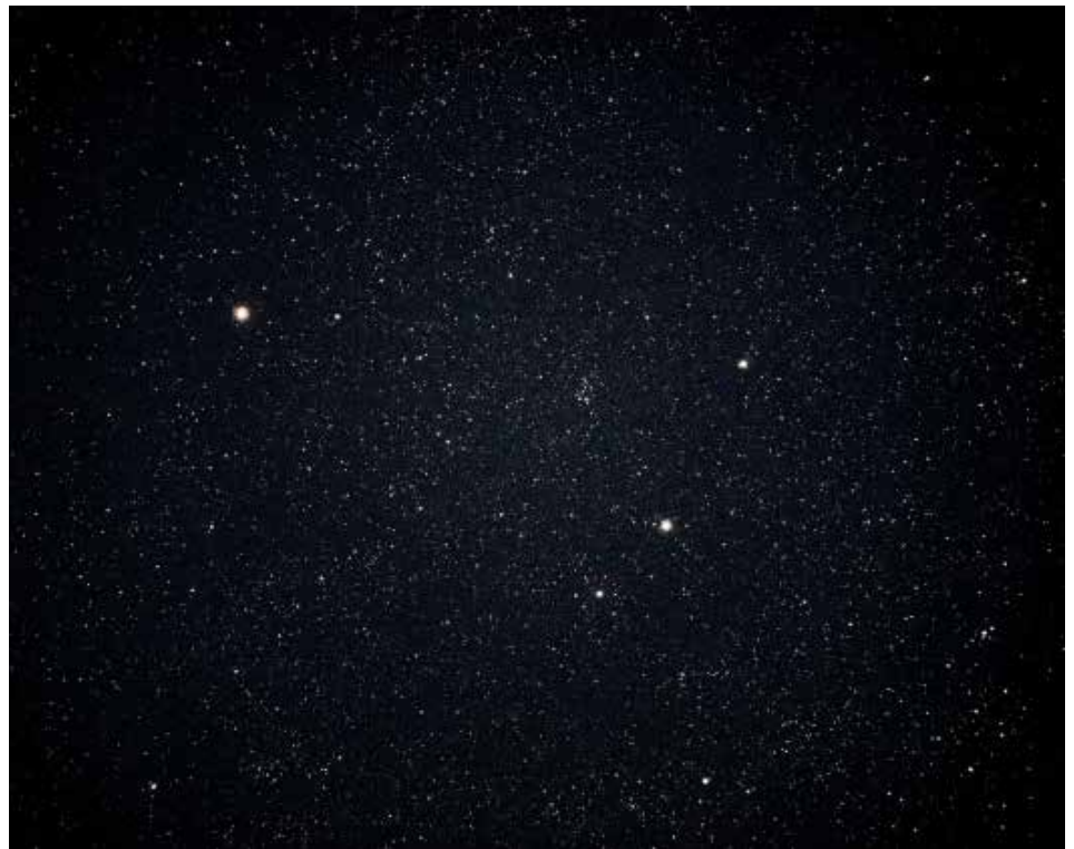
↑ Trevor Paglen, "An Unseen Star" (OR-1 Search in Cepheus) Delamar Dry Lake, NV

Collection of the Nevada Museum of Art, Gift of the Brandywine Workshop and Archives, Philadelphia, Pennsylvania.