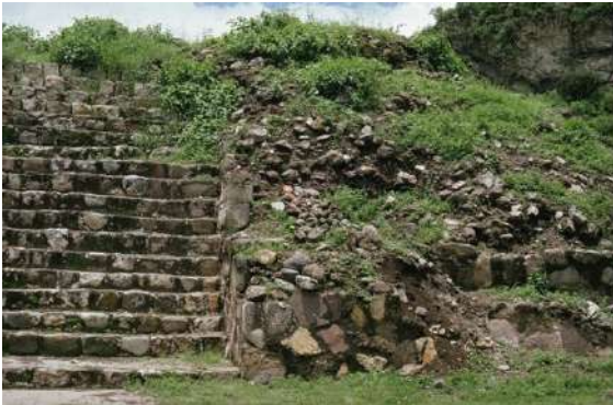
Ana Mendieta Burial Pyramid 1974 (Estate print 2010) Color Photograph 16 x 20 inches (40.64 x 50.8 cm) Collection of the Nevada Museum of Art, The Robert S. and Dorothy J. Keyser Art of the Greater West Collection Fund