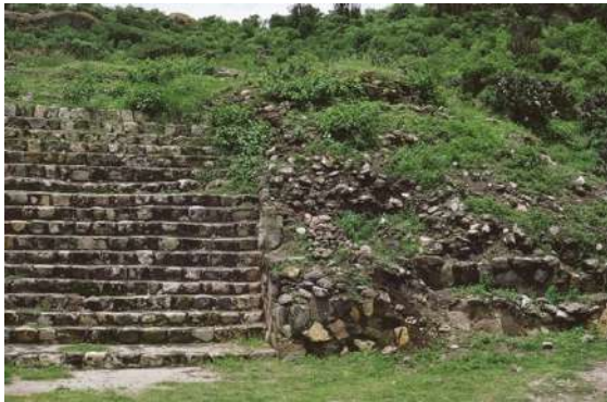
Ana Mendieta Burial Pyramid 1974 (Estate print 2010) Color Photograph 16 x 20 inches (40.64 x 50.8 cm) Collection of the Nevada Museum of Art, The Robert S. and Dorothy J. Keyser Art of the Greater West Collection Fund