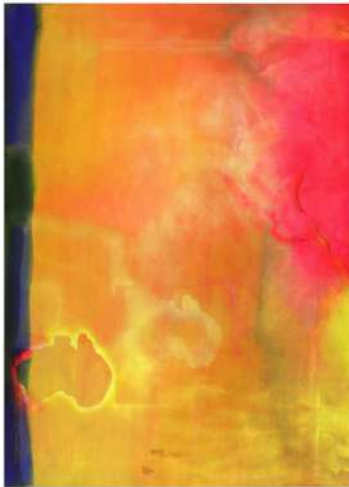
Frank Bowling Traveling with Robert Hughes 1969-70 Acrylic on canvas 9 ft 3 1/8 inches x 6 ft. 11 3/8 in. ( ) Joyner/Giuffrida Collection