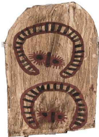
Unknown Artist Wandjina , 1980s Natural earth pigments on eucalyptus bark 17 5/7 x 9 1/4 in. (45 x 23.5 cm) Collection of the Nevada Museum of Art, Gift of Debra and Dennis Scholl