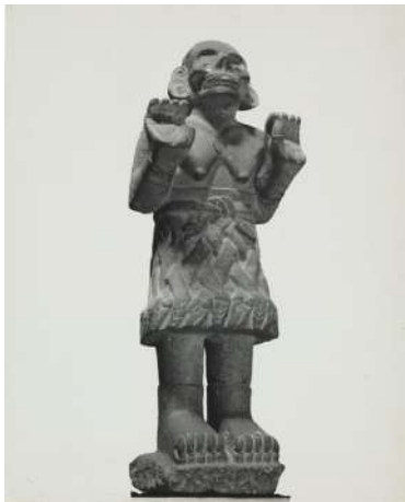
Manuel Alvarez Bravo Coatlicue Death Goddess from The Aztec Artifacts , 1930s-1940s Gelatin silver print 9 1/2 x 7 1/2 inches (24.13 cm x 19.05 cm) Collection of the Nevada Museum of Art, The Robert S. and Dorothy J. Keyser Art of the Greater West Collection Fund