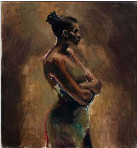
Lynette Yiadom-Boakye Godly Governance , 2013 Oil on canvas 59 x 55 inches (149.9. x139.7 cm) Joyner/Giuffrida Collection