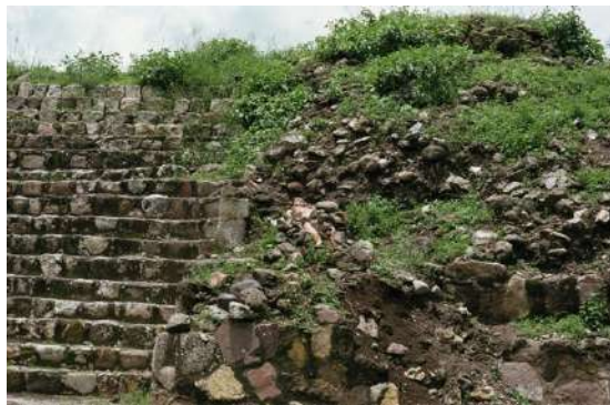
Ana Mendieta Burial Pyramid 1974 (Estate print 2010) Color Photograph 16 x 20 inches (40.64 x 50.8 cm) Collection of the Nevada Museum of Art, The Robert S. and Dorothy J. Keyser Art of the Greater West Collection Fund