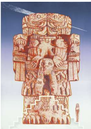
Ester Hernandez El Encuentro , 1991 Offset lithograph 30 x 21 7/8 inches (76.2 cm x 55.88 cm) Collection of the Nevada Museum of Art, Gift of the Brandywine Workshop and Archives, Philadelphia, Pennsylvania