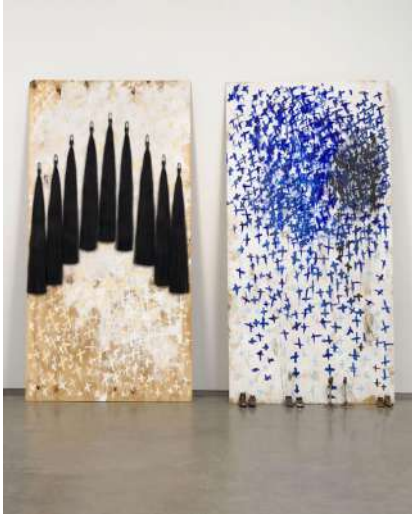
Allison Janae Hamilton Yard Sign with Yellow and White Constellation, Yard Sign with Blue Constellation, 2019 Mixed media on panel overall dimensions: 96 x 104 inches (243.84 cm x 264.16 cm) Collection of the Nevada Museum of Art, purchased with funds from deaccessioning