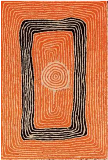
Johnny Yungut Tjupurrula Untitled , 2000 Synthetic polymer paint on linen 48 1/8 x 35 7/8 inches Collection of the Nevada Museum of Art, Gift of Debra and Dennis Scholl