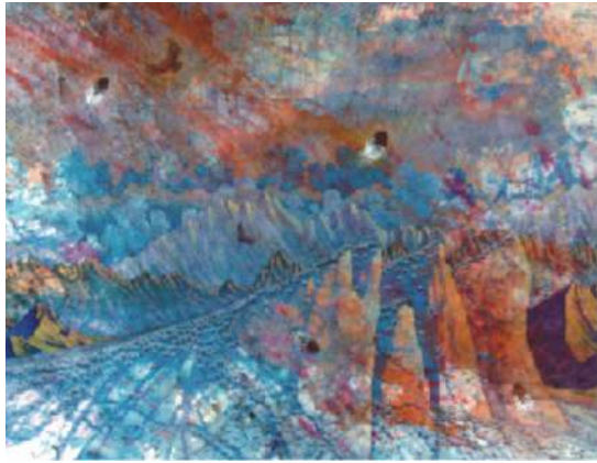
Jack Malotte Untitled, 1982 Watercolor on paper 22 x 29 inches (55.88 cm x 73.66 cm) Collection of the Nevada Museum of Art, Gift of William and Janet Abernathy