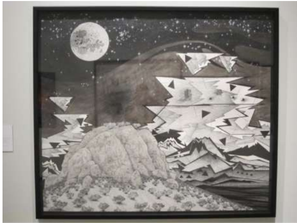
Jack Malotte A Creation Story, 2012 Ink on paper 52 x 60 inches (123.08 cm x 152.4 cm) Collection of the Nevada Museum of Art, Museum purchase with funds provided by deaccessioning