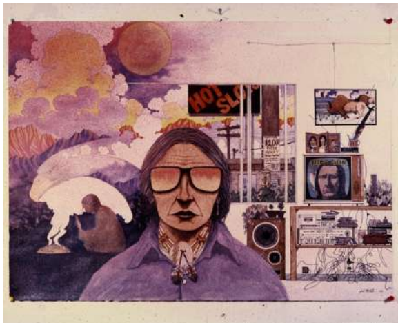
Jack Malotte It's Hard To Be Traditional When You're All Plugged In, 1983 Ink and acrylic 22 x 30 inches (55.88 cm x 76.2 cm) Collection of the Nevada Museum of Art, purchased with funds provided by the Orchard House Foundation