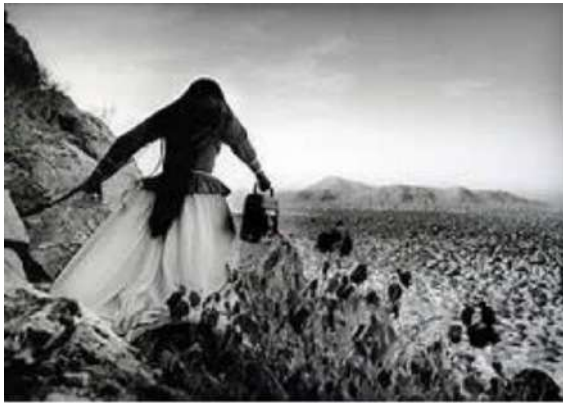
Graciela Iturbide Mujer Angel, Desierto de Sonora (Angel Woman, Sonora Desert) from the series Los que viven en la arena 1979 Gelatin silver print 13 x 19 inches (33.02 cm x 48.26 cm) Collection of the Nevada Museum of Art, The Robert S. and Dorothy J. Keyser Foundation Art of the Greater West Collection Fund