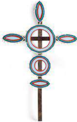
Roy Wiggan Untitled (Ilma) , 2002 Synthetic polymer paint, cotton, wool and wire on wood 36 2/9 x 13 inches (92 x 33 cm) Collection of the Nevada Museum of Art, Gift of Debra and Dennis Scholl