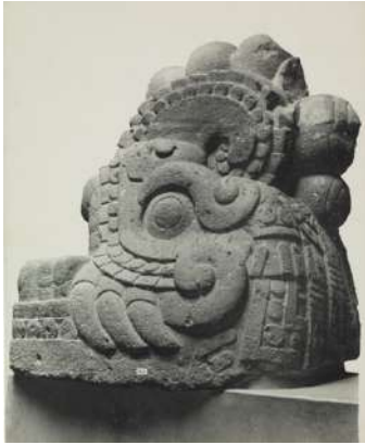
Manuel Alvarez Bravo Quetzalcoatl in the Shape of a Serpent from The Aztec Artifacts 1930s-1940s Gelatin silver print 9 1/2 x 7 1/2 inches (24.13 cm x 19.05 cm) Collection of the Nevada Museum of Art, The Robert S. and Dorothy J. Keyser Art of the Greater West Collection Fund