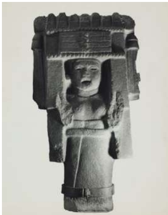
Manuel Alvarez Bravo Chicomecóatl, Corn Goddess from The Aztec Artifacts , 1930s-1940s Gelatin silver print 9 1/2 x 7 1/2 inches (24.13 cm x 19.05 cm) Collection of the Nevada Museum of Art, The Robert S. and Dorothy J. Keyser Art of the Greater West Collection Fund