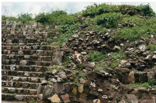
Ana Mendieta Burial Pyramid 1974 (Estate print 2010) Color Photograph 16 x 20 inches (40.64 x 50.8 cm) Collection of the Nevada Museum of Art, The Robert S. and Dorothy J. Keyser Art of the Greater West Collection Fund