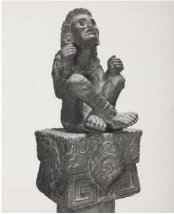
Manuel Alvarez Bravo Xōchilipilli ,God of flowers and dancing, gaming and fiestas from The Aztec Artifacts , 1930s-1940s Gelatin silver print 9 1/2 x 7 1/2 inches (24.13 cm x 19.05 cm) Collection of the Nevada Museum of Art, The Robert S. and Dorothy J. Keyser Art of the Greater West Collection Fund