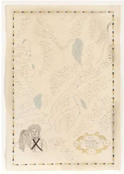
Umar Rashid Map of the Pyramid Lake Region, 2012 Acrylic, ink, coffee, tea on paper 44 x 32 inches (111.76 cm x 81.28 cm) Collection of the Nevada Museum of Art, Museum purchase with funds provided by the Contemporary Art Collection Acquisition Fund