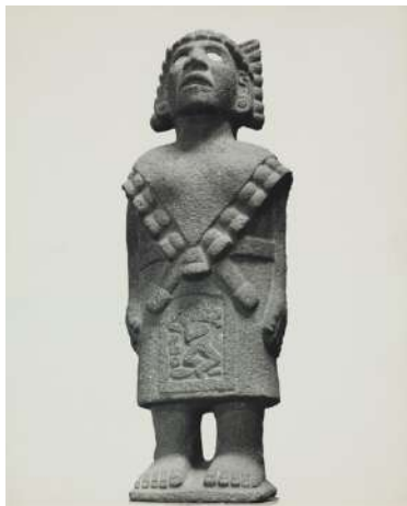
Manuel Alvarez Bravo Untitled (Standing Figure) from The Aztec Artifacts , 1930s-1940s Gelatin silver print 9 1/2 x 7 1/2 inches (24.13 cm x 19.05 cm) Collection of the Nevada Museum of Art, The Robert S. and Dorothy J. Keyser Art of the Greater West Collection Fund