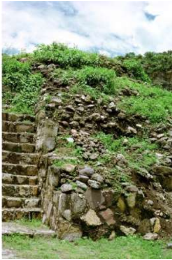
Ana Mendieta Burial Pyramid 1974 (Estate print 2010) Color Photograph 16 x 20 inches (40.64 x 50.8 cm) Collection of the Nevada Museum of Art, The Robert S. and Dorothy J. Keyser Art of the Greater West Collection Fund