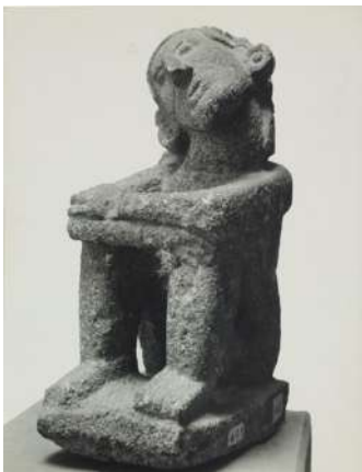
Manuel Alvarez Bravo Seated Figure from The Aztec Artifacts, 1930s-1940s Gelatin silver print 9 1/2 x 7 1/2 inches (24.13 cm x 19.05 cm) Collection of the Nevada Museum of Art, The Robert S. and Dorothy J. Keyser Art of the Greater West Collection Fund