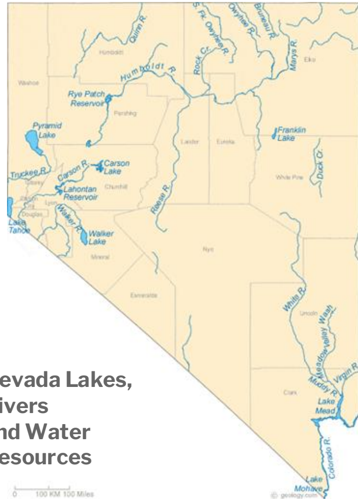
Nevada Lakes, Rivers and Water Resources